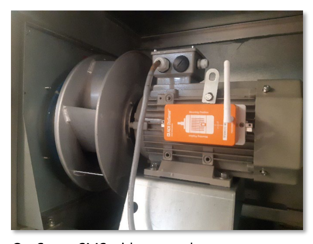
OtoSense SMS with external antenna