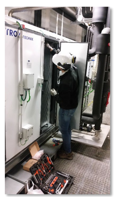
SMS installed on Conditioning Turbine inside the cabinet